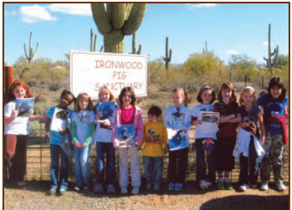
Girl Scout Troop #1975 - Tucson Arizona